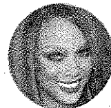
Tyra Banks having dinner with a friend at T-Bar at Savannah's in Southampton