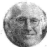
Larry David shooting "Curb Your Enthusiasm" at the Carlton Hotel