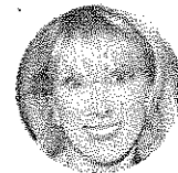
"Housewife" Ramona Singer drinking pinot grigio at Flex Mussels