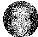
Singer Ciara having dinner with friends at Philippe Chow